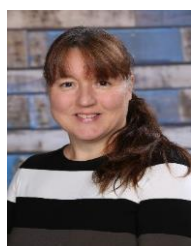
FS1 teacher and Foundation Stage Leader

We would like to introduce you to our team.